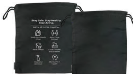
Back with Health & Safety Message

Keep your mask clean and safe with this moisture resistant 100% cotton drawstring storage bag.