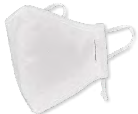
NANO-TECH FACE MASK | CMK-3